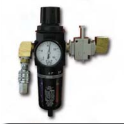
LOCKOUT VALVE AND FILTER REGULATOR

Herkules lifts are equipped with a standard valve package with either a hand or foot controller. Both the easy-to-use joystick and foot control have well-marked instructions. Customized valve upgrade packages as well as customized controllers are available. Safety orange is the standard color. Optional colors are available.