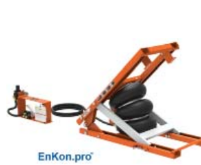
With 12169 16997