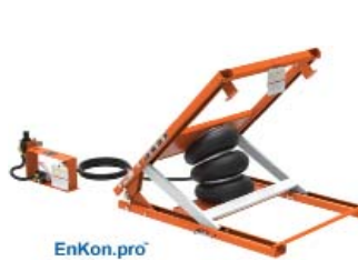
With 12169 16997