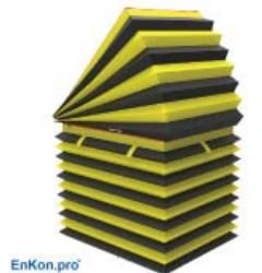
With 1007952 - Qty 2