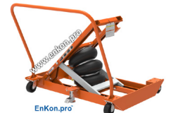
EnKon.pro With 13826