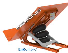
EnKon.pro With 13809