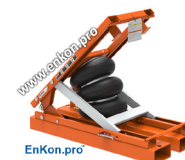
EnKon.pro With 13825