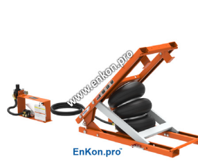
EnKon.pro With 12169 16997