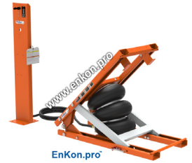
EnKon.pro With 12522