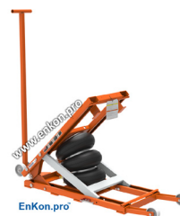
EnKon.pro With 13822