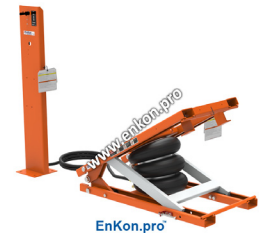
With 12522 16997