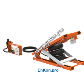
With 12169 16997