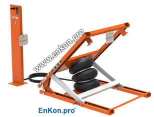
With 12522 16997