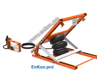
With 12169 16997