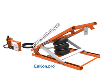
With 12169 16997