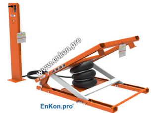
With 12522 16997