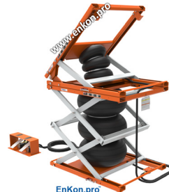
EnKon.pro With 13752