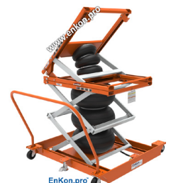
EnKon.pro With 13760