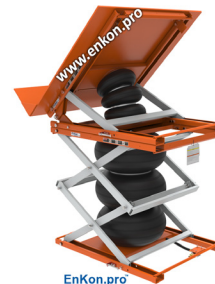
EnKon.pro With 13786