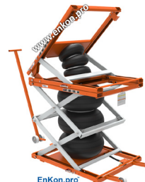
EnKon.pro With 13761