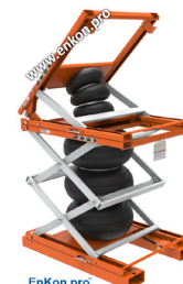
EnKon.pro With 13768