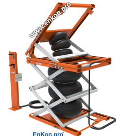
EnKon.pro With 12347