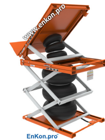
EnKon.pro With 13788