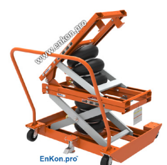
EnKon.pro With 13825