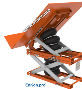
EnKon.pro With 13808