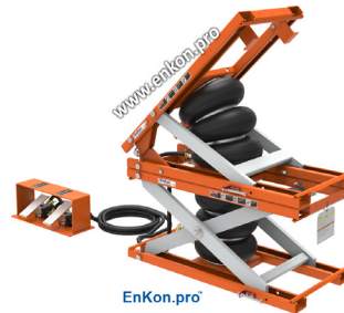
EnKon.pro With 13752