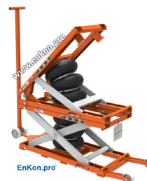
EnKon.pro With 13822