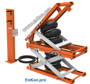
EnKon.pro With 12347