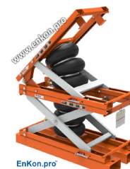
EnKon.pro With 13826