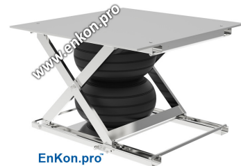
EnKon.pro With 17071