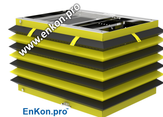
EnKon.pro With 1007951