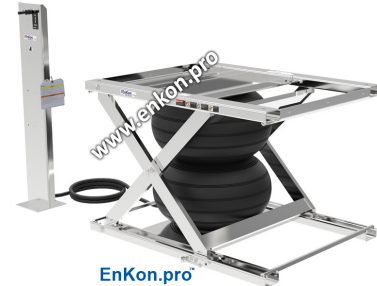
EnKon.pro With 13775