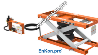
With 12169 16997