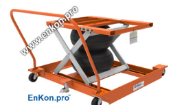
EnKon.pro With 13760