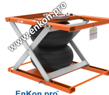
EnKon.pro With 13689