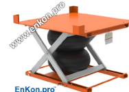
EnKon.pro With 16529