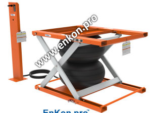
EnKon.pro With 12522