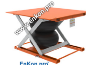
EnKon.pro With 13427