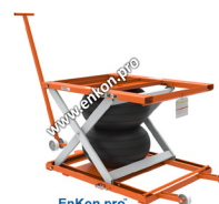
EnKon.pro With 13761