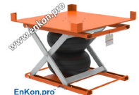
EnKon.pro With 16526