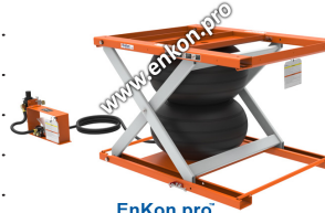
EnKon.pro With 12169 16997