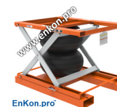
EnKon.pro With 13768